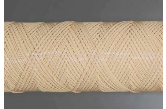
Figure 2: PEEK Hollow fiber membrane contactor developed to increase the efficiency of carbon capture from power plant flue gas

Membranes like the poly (ether ether ketone) (PEEK) hollow fiber membrane can be used to separate carbon dioxide (CO 2 ) from flue gas, which is then absorbed into a liquid. 6 The Materials Manufacturing Accelerator initiative could unleash the potential of advanced materials for separation processes by increasing access to tools such as modeling and simulation or high throughput experimentation to verify products that can separate desired components at preferred conditions such as higher pressures and temperatures and low concentrations, with reduced degradation over time.