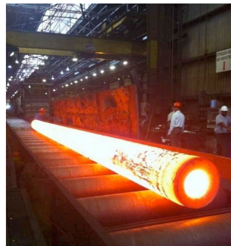
Figure 1: Extrusion of Inconel 740H Pipe at Wyman Gordon plant

Inconel is an example of an alloy under investigation for use in advanced ultra-supercritical steam boilers (at temperatures up to 760 degrees Celsius and pressures up to 5500 pounds per square inch) which will allow for the generation of electricity from coal-fired power plants at higher efficiency. 4 Materials such as Inconel have additional applicability for high temperature, high pressure piping in gas fired carbon dioxide Brayton cycles for carbon capture and solar powered carbon dioxide Brayton cycles. 5 By better understanding microstructural factors, steam-side oxidation resistance, and other characteristics that can help predict the life of alloys, the Materials Manufacturing Acceleration initiative could help accelerate the design, development, characterization and standardization of alloys like Inconel which will allow for its deployment into the marketplace.