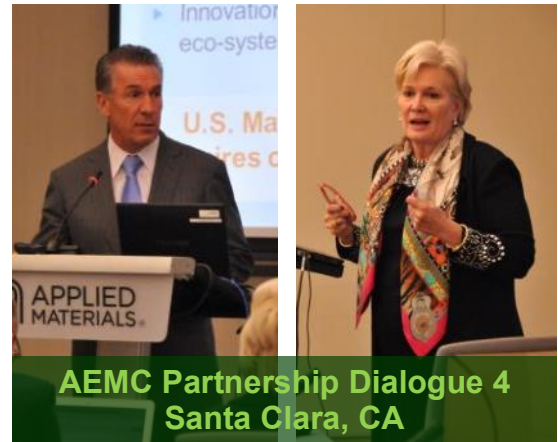
AEMC Partnership Dialogue 4 Santa Clara, CA

Lowering barriers to the scaling of existing, promising prototypes in the clean energy space by placing strategic resources on both sides of the scale-up “valley of death.”