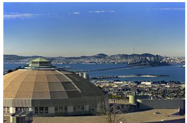
Figure X: The Advanced Light Source at Lawrence Berkeley National Laboratory

The Materials Project, 10 the instantiation of the Materials Genome Initiative, is the