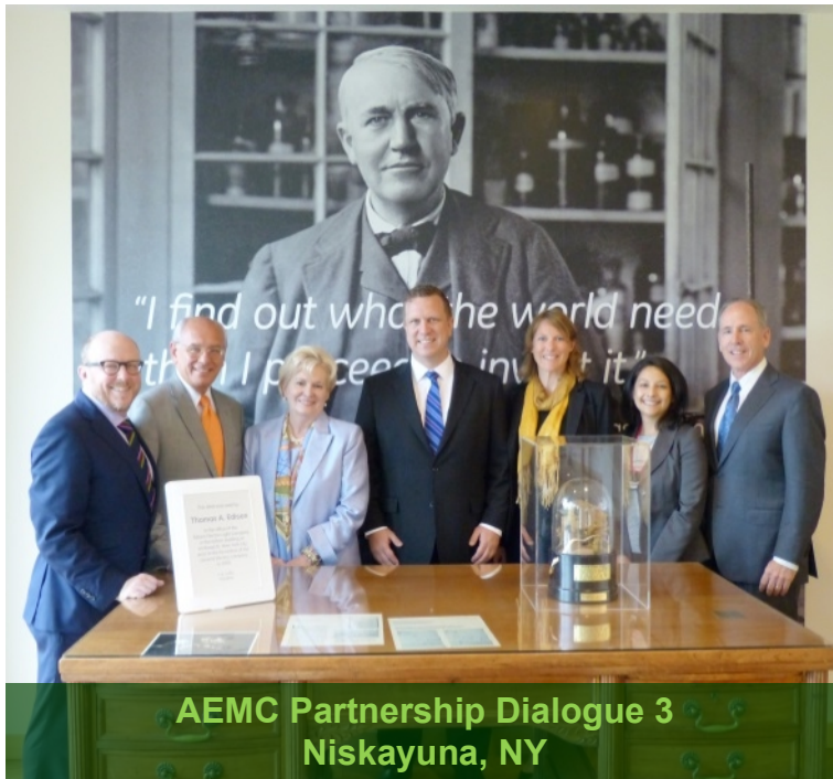
AEMC Partnership Dialogue 3 Niskayuna, NY