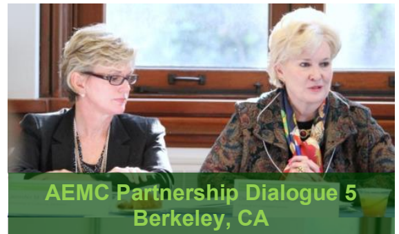
AEMC Partnership Dialogue 5 Berkeley, CA