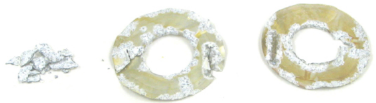
Figure 3: Aluminum fins from a geothermal power plant subjected to 24,000 cycles of exposure to briny conditions with: no protective coating (left), nano-coating with a low level of Cerium Oxide (middle), and a nano coating with a higher concentration of Cerium Oxide (right).

Coatings like an ultrathin coating with rare-earth metal oxide nanoparticles mitigate the corrosion effects from brine in aluminum fins in air-cooled condensers at geothermal power plants. 7 By increasing access to materials data and expertise, modeling and simulation capabilities, and high throughput experimentation tools, the Materials Manufacturing Accelerator initiative could continue the discovery of durable, economical, and more environmentally friendly coatings and efficient and optimal methods for their application.